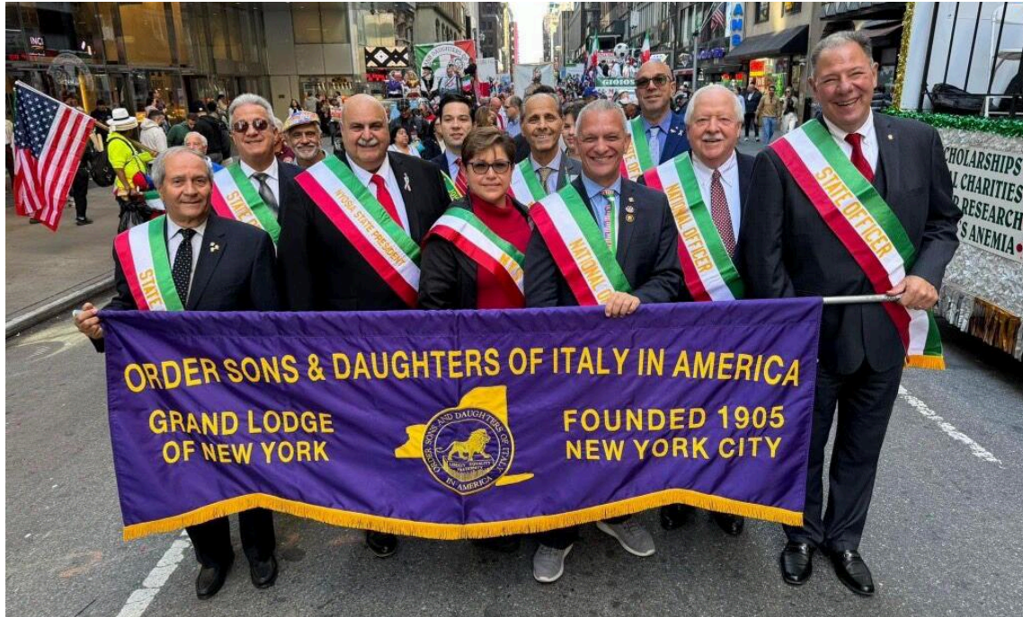
OSDLA leaders from the Supreme Lodge and the Grand Lodge of New York at the front of the annual Columbus Day Parade in New York City (October 14th).

The 80th annual Columbus Day parade in New York city was led by a delegation of OSDIA leaders from the Supreme Lodge and from the Grand Lodge of New York. The parade spanned throughout Midtown, starting on 5th Avenue and ending on 72nd Street, and drew hundreds of Italian Americans and supporters of the community from throughout New York in a celebration of Italian American heritage.