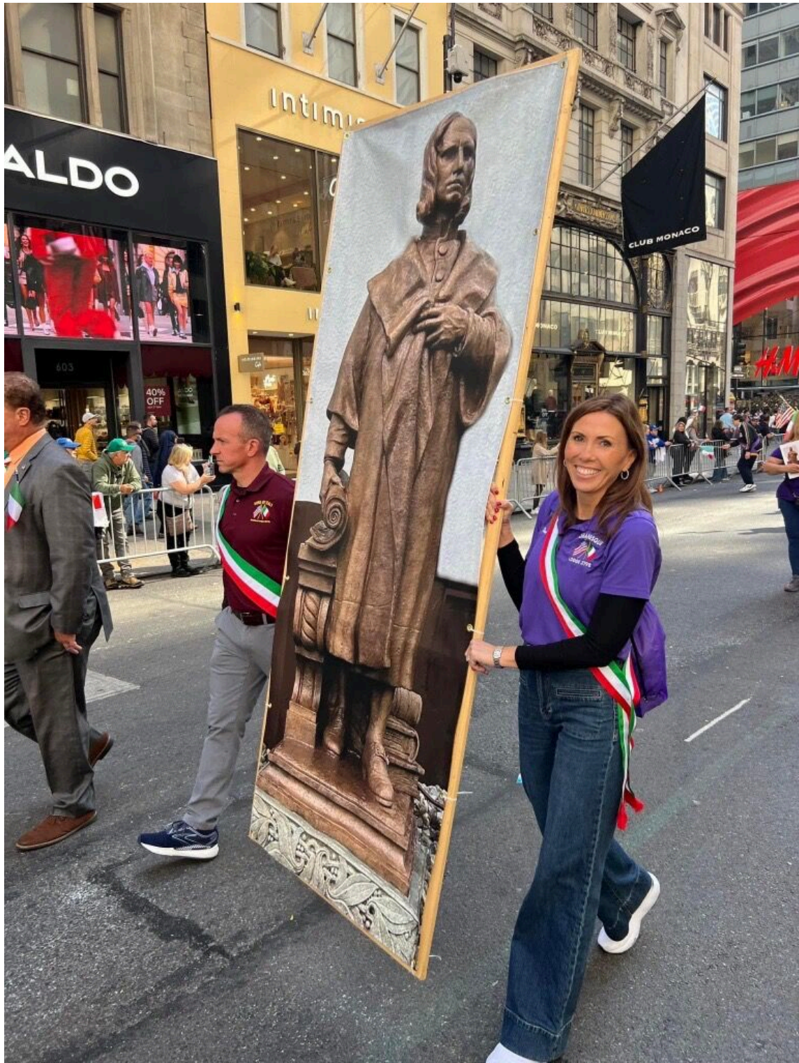
A photo of a Christopher Columbus statue being carried through the streets of New York during the annual Columbus Day parade (October 14th).