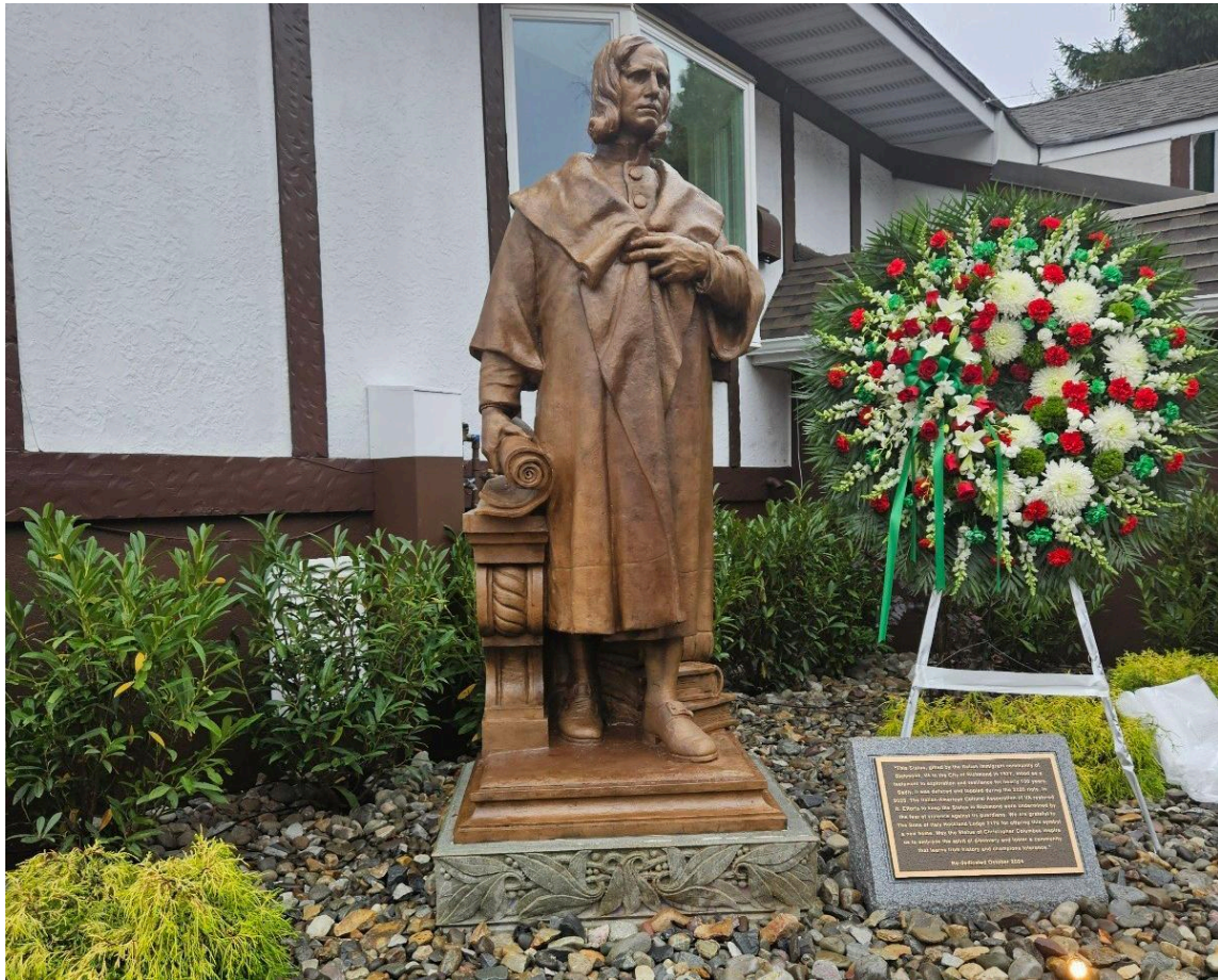
The newly restored Columbus Statue outside Rockland Lodge #2176 in Blauvelt, New York.

A once-torn-down Columbus Statue now has a safe home outside of Rockland Lodge #2176 in Blauvelt, New York. The nearly 2000-pound statue was defaced and thrown in a river in 2020 by anti-Columbus protests in Richmond, Virginia, but lodge members spent thousands of dollars restoring the statue and transporting it to their lodge in Blauvelt.